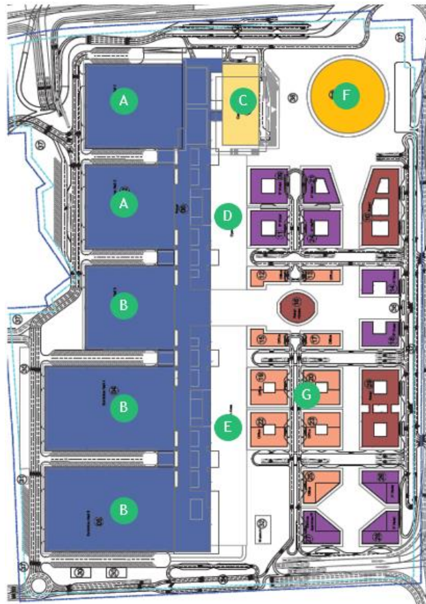
Fig. 2: Layout concept of IICC as per indicative master plan

1.1.5 The IICC district is proposed to include approximately 300,000 sq. m. of covered exhibition space (240,000 sq. m. of indoor exhibition space, 60,000 sq. m. of foyer space) and 60,000 sq. m. of convention space, as well as 50,000 sq. m. of outdoor exhibition space. In addition, it is planned to contain a sports arena of approximately 50,000 sq. m., approximately 260,000 sq. m. of hotel space, and approximately 380,000 sq. m. of commercial space for retail, entertainment and class-A offices. Approximately 28,000 basement-level car-parking spaces are also proposed. The size and diversity of the IICC suggests that each area will have unique features that define both the challenges and the opportunity to stimulate investment and generate a desirable level of success.