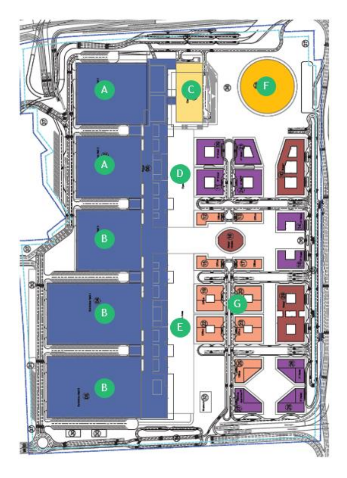
Fig. 2: Layout concept of IICC as per indicative master plan

1.1.5 The IICC district is proposed to include approximately 300,000 sq. m. of covered exhibition space (240,000 sq. m. of indoor exhibition space, 60,000 sq. m. of foyer space) and 60,000 sq. m. of convention space, as well as 50,000 sq. m. of outdoor exhibition space. In addition, it is planned to contain a sports arena of approximately 50,000 sq. m., approximately 260,000 sq. m. of hotel space, and approximately 380,000 sq. m. of commercial space for retail, entertainment and class-A offices. Approximately 28,000 basement-level car-parking spaces are also proposed. The size and diversity of the IICC suggests that each area will have unique features that define both the challenges and the opportunity to stimulate investment and generate a desirable level of success.