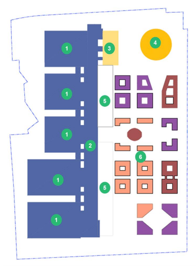
Fig. 2: Layout concept plan of IICC as per indicative master plan

1.1.5 The IICC district is proposed to include approximately 300,000 sq. m. of covered exhibition space (240,000 sq. m. of indoor exhibition space, 60,000 sq. m. of foyer space) and 60,000 sq. m. of convention space, as well as 50,000 sq. m. of outdoor exhibition space. In addition, it is planned to contain a sports arena of approximately 50,000 sq. m., approximately 260,000 sq. m. of hotel space, and approximately 380,000 sq. m. of commercial space for retail, entertainment and class-A offices. Approximately 28,000 basement-level car-parking spaces are also proposed. The size and diversity of the IICC suggests that each area will have unique features that define both the challenges and the opportunity to stimulate investment and generate a desirable level of success.